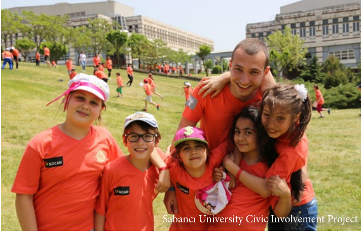
Sabancı University Civic Involvement Project

Other unique features of undergraduate education at SU include "Civic Involvement Projects" that are conducted jointly with NGOs, and diverse extra-curricular activities supported by 48 student clubs.