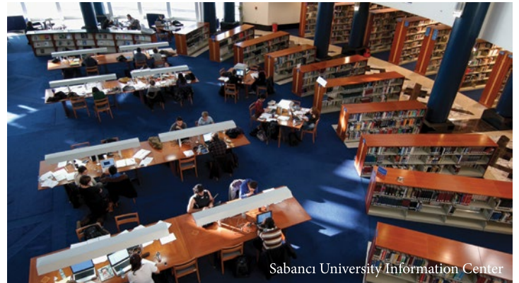
Sabancı University Information Center