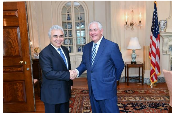
Dr. Fatih Birol met with U.S. Secretary of State Rex Tillerson in his office at the U.S. State Department

Birol’s travels to Washington concluded on 19 July with a meeting with the U.S. Secretary of State, Rex Tillerson. Dr. Birol and Secretary Tillerson discussed developments in the global energy landscape and their implications for the United States and the world. Tillerson and Birol also shared views on the critical role that the IEA plays in world-wide energy security and Dr. Birol’s plans to modernize the IEA for the 21 st Century.