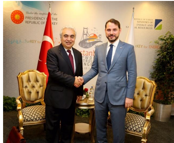
Dr. Fatih Birol met with His Excellency Berat Albayrak

Birol also mentioned that "Climate change is important, a strategically important challenge for all of us. We need Europe, we need China, we need India, all of the countries, to be part of a solution". Birol said the U.S. was the country that reduced emissions the most last year, pointing out shale gas replacing coal and making more use of renewable energies (wind and solar power).