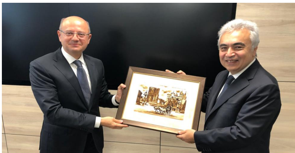
Minister of Energy Parviz Shahbazov and Dr. Fatih Birol met in Baku to deepen the IEA relationship with Azerbaijan