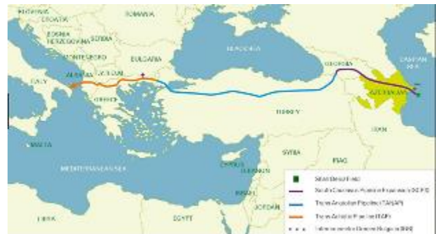
Map of TANAP

Linking East-to-West, TANAP serves as the critical bridge; running through 20 cities in Turkey, it forms the backbone of the SGC. The implementation of the SGC, one of the priority energy projects for the European Union, is important for Azerbaijan, Turkey and Europe. TANAP will deliver 6 bcm/year of Caspian gas to Turkey and 10 bcm/year to Europe 10 . BOTAŞ, Turkey’s natural gas pipeline distributor, will buy 2 bcm of gas until June 2019, increasing to 6 bcm by 2021.