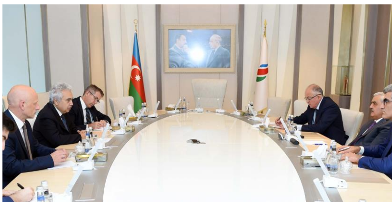
Dr. Fatih Birol met with SOCAR President Rovnag Abdullayev and his staff

Completing Dr. Birol's mission to Azerbaijan, he also met with the representatives of the World Bank, the Islamic Development Bank, the Asian Development Bank, the European Bank for Reconstruction and Development (EBRD) to discuss the financing needed to meet region's growing demand for energy infrastructure. (An important feature of the IEA World Energy Outlook series has been to estimate future infrastructure requirements by sector and region, bringing to the world's attention the importance of global energy infrastructure financing).